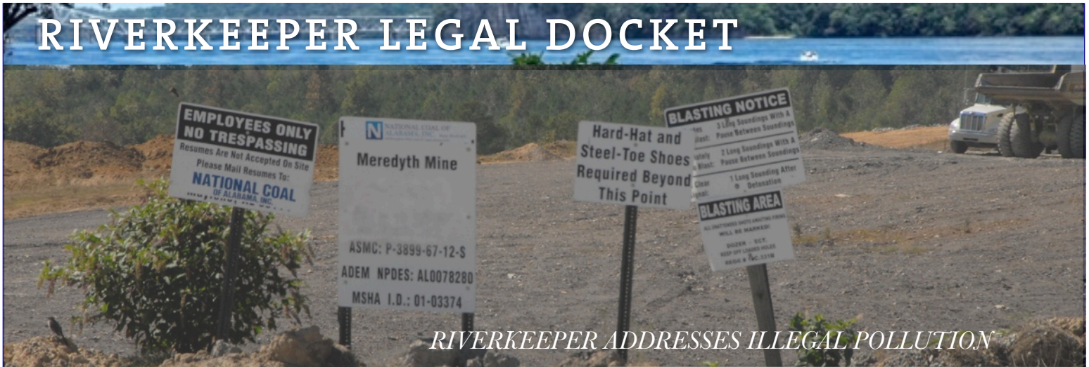
RIVERKEEPER ADDRESSES ILLEGAL POLLUTION