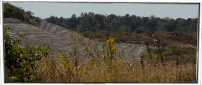
Meredyth Mine near Haleyville, AL pollutes Bear Creek, a tributary of the Tennessee River.

MEREDYTH MINE - [HALEYVILLE] - Tennessee Riverkeeper's lawsuit against Hope Coal Company continues and we have added National Coal of Alabama as a defendant. Both defendants have filed motions to dismiss arguing that ADEM's administrative consent order precludes our suit. Our attorney has filed briefs and we are waiting for the court to rule on the issue. Meanwhile, National Coal has taken over operation of the mine.