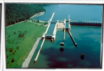
Guntersville Dam & Reservoir