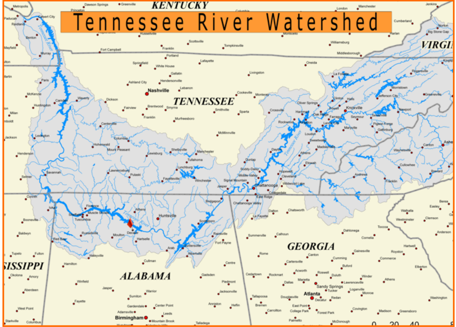
© Watershed map developed by Tennessee Riverkeeper and the University of Alabama.

Q: What services do Volunteers perform for Riverkeeper? A: Volunteers play a crucial role in our anti-pollution mission. For a list of our varying volunteer projects visit: www.tennesseeriver.org/volunteers.html