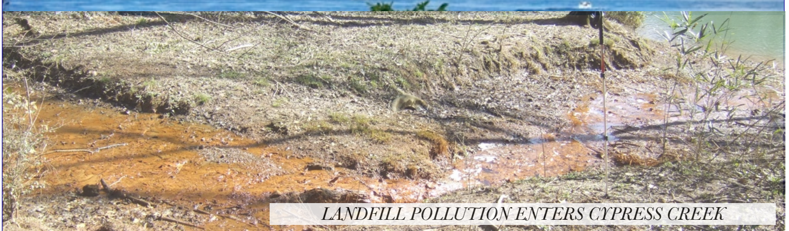
LANDFILL POLLUTION ENTERS CYPRESS CREEK