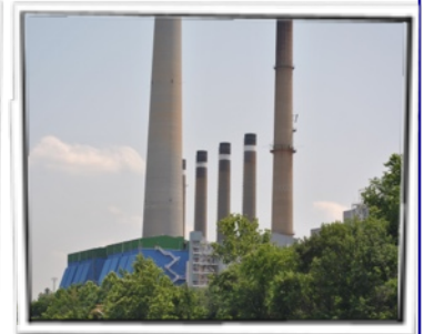
TVA Colbert Fossil Plant