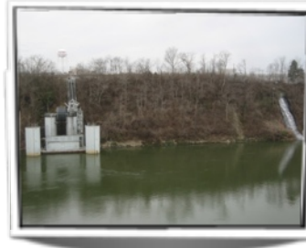
Carlex Glass Company in Nashville, Tennessee.