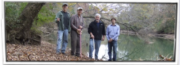
Monitoring pollution from the Old Florence Landfill.

Through this lawsuit, Tennessee Riverkeeper utilized a legal tactic under the Resource Conservation and Recovery Act. Tennessee Riverkeeper brought the legal action under the Clean Water Act for the unpermitted discharge and added the RCRA claim to give the lawsuit more strength. In denying the defendant's motion to dismiss, the District Court allowed the RCRA claim as properly plead, thus validating our theory that RCRA is applicable to our case. The landfill was pre-regulations and was properly closed before the RCRA regulations, but falls under RCRA now