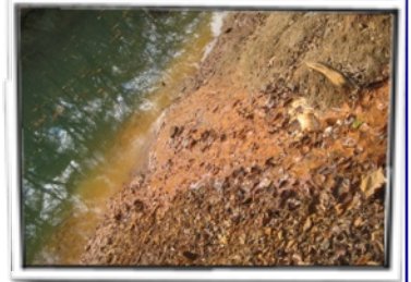
Illegal leachate from old Florence landfill enters Cypress Creek.