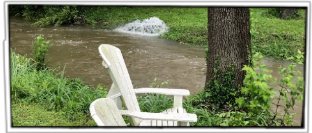
Sewage overflows in entering Richland Creek in Nashville

Scientific data and headlines in the news about water quality prove that Alabamians have been let down by elected leaders. Environmental protection has been politicized by our leaders who appear unconcerned about the health, safety, and wellbeing of the people. Clean water is a non-partisan issue and every citizen deserves access to safe drinking water from a public supply. When so-called public servants stand against their citizens to defend illegal pollution, the Riverkeepers will dare to defend our rights.