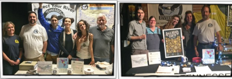
Team Riverkeeper with Rising Appalachia Team Riverkeeper with Railroad Earth

Special thanks to Farm Burger Huntsville, Railroad Earth, Marathon Music Works, Rising Appalachia, Flying Monkey Arts, and Mountain High Huntsville for their generous support of Riverkeeper in 2017.