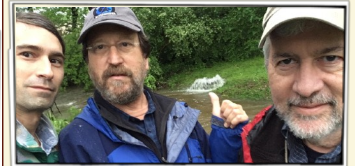
On pollution patrol in Nashville, TN on April 22, 2017

Earth Day 2017 in Nashville (TN) was rained out so Team Riverkeeper went on patrol documenting sewage and other illegal pollution discharges.