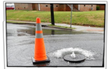
Tennessee Riverkeeper urged waste treatment facilities provide to better public notifications when sewage spills and overflows occur.