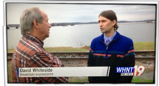
Whiteside discussing sewage on the WHNT-19 (ABC) News