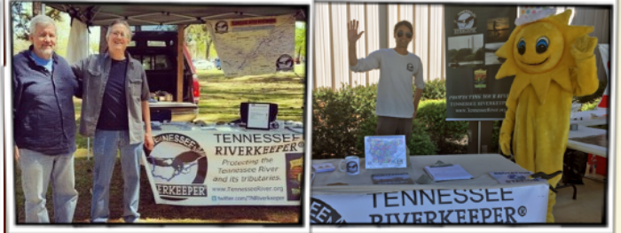
Earth Day 2017. L: in Muscle Shoals on April 8, 2017. R: in Athens, AL on April 29, 2017

Tennessee Riverkeeper participated in Earth Day events in the month of April throughout the Cumberland and Tennessee River watersheds from: Muscle Shoals (AL), Huntsville (AL), Athens (AL), and Chattanooga (TN).